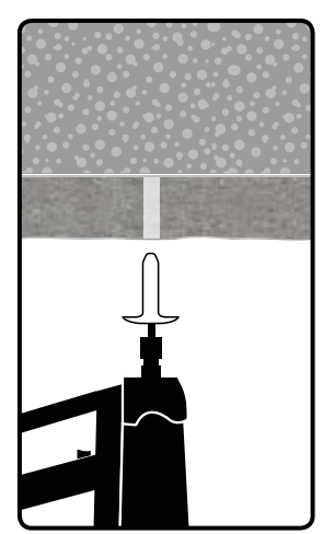
Locate the pre-positioned hole in the insulation sheet Insert fixing into position.