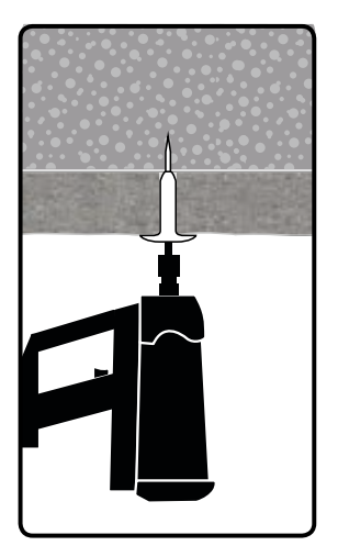
Press trigger of tool to fasten nail into base material - fixing complete.